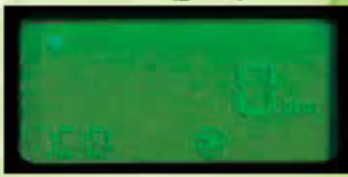
Normal screen (green)