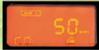
Caution screen (orange)