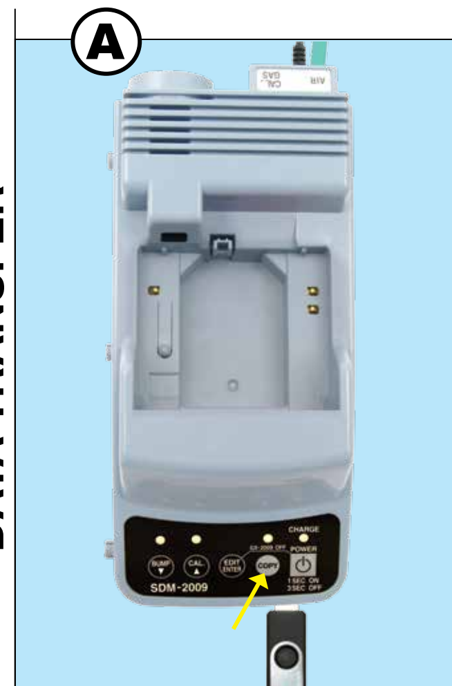
Data Transfer To USB Flash Drive

With USB flash drive installed and unit powered on, press and release the COPY button. The COPY LED will become solid red while the records in the calibration station's memory are copied to the flash drive. In addition, the flash drive's LED will begin to blink.